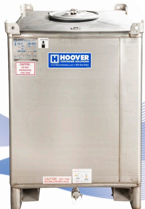
793 Gallon Center Drain Product Number 372422