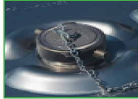
3" Fill Cap