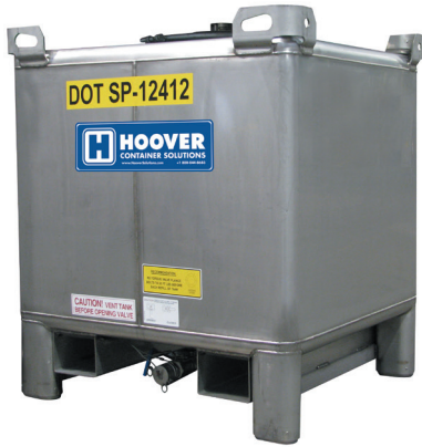
Cargo Valve IBC Product Number 372102