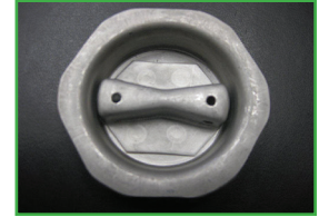
2" Top Bung