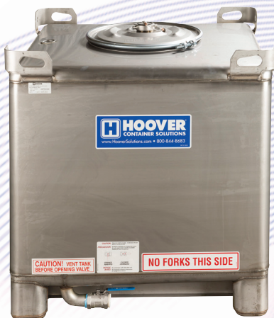
350 Gallon - Side Drain Product Number 370494