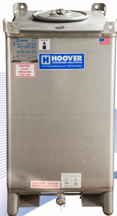
550 Gallon - Center Drain Product Number 372412