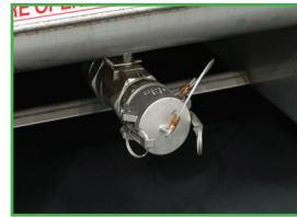
Center Drain Discharge Assembly